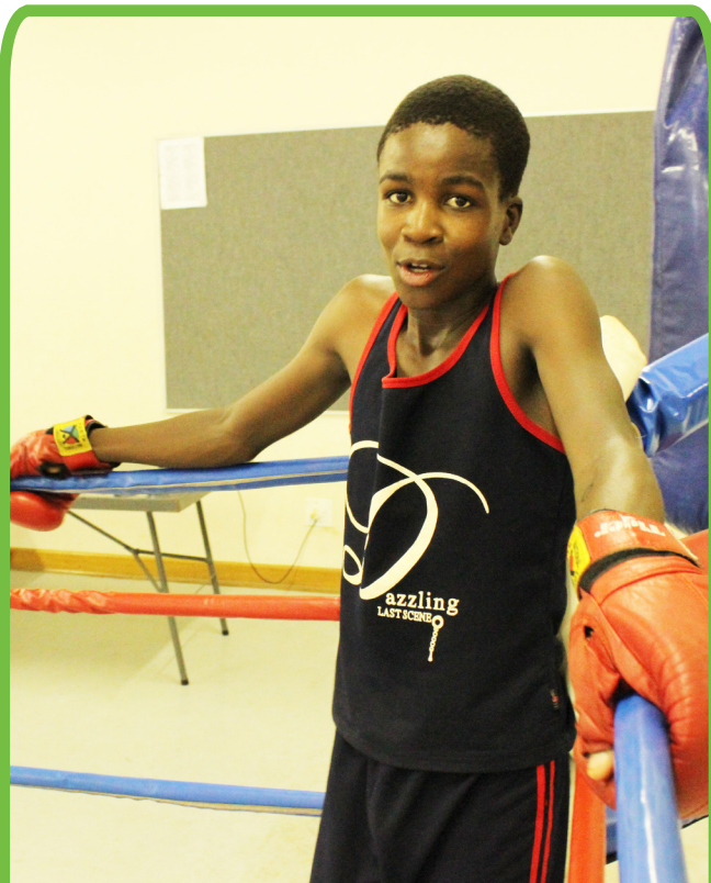
Young and upcoming boxer