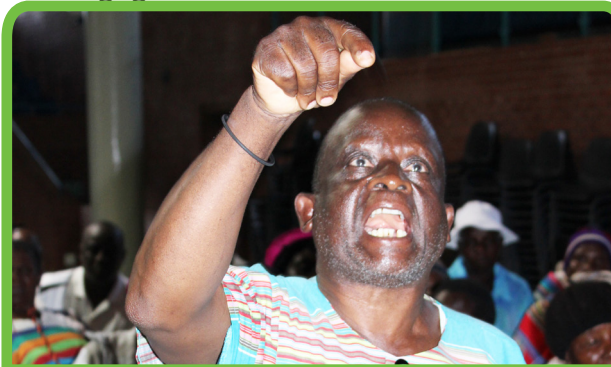
An elder asking for more clarity during the question and answers session