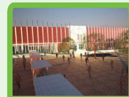
Thohoyandou, a mega city on the rise...Page 7