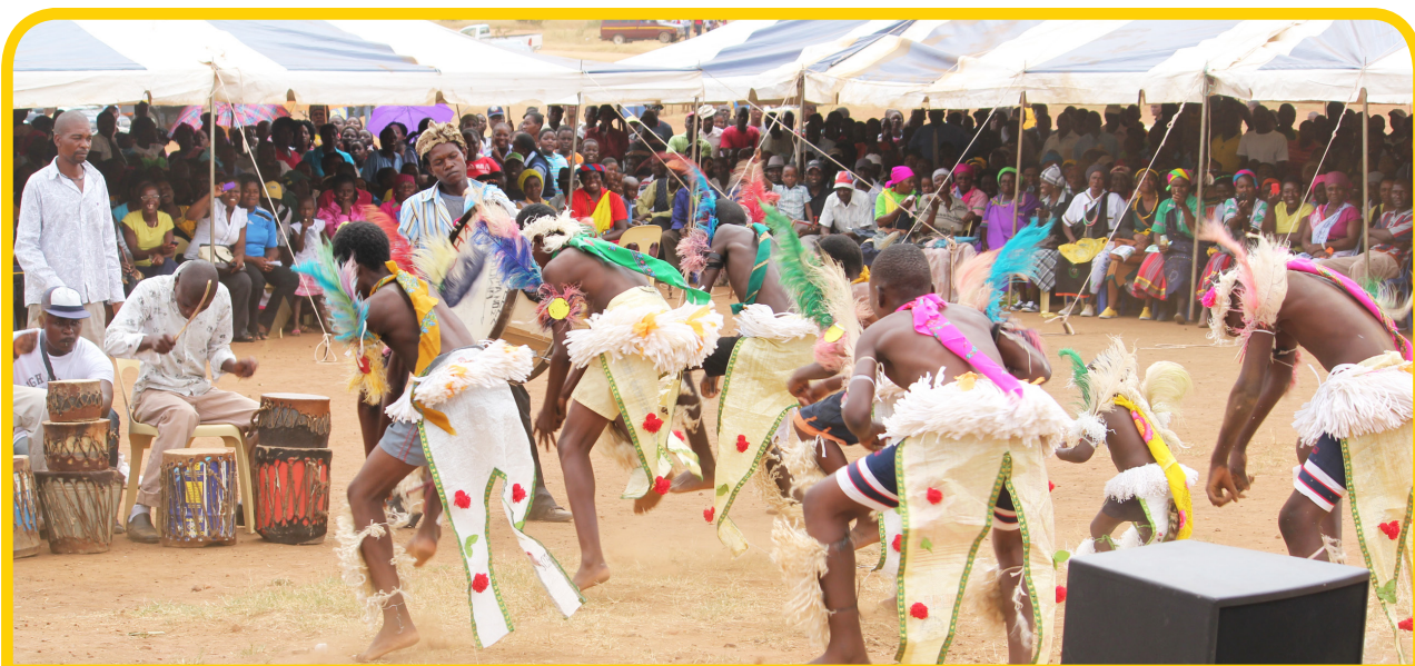
Makhwaya traditional group perform for community members

After much of the speeches, then came time for good news to the aspirant business men and women. The Thulamela Municipality has now embarked on business mind expansion with Nedbank. The relationship with the bank will help expand small business into reputable businesses.