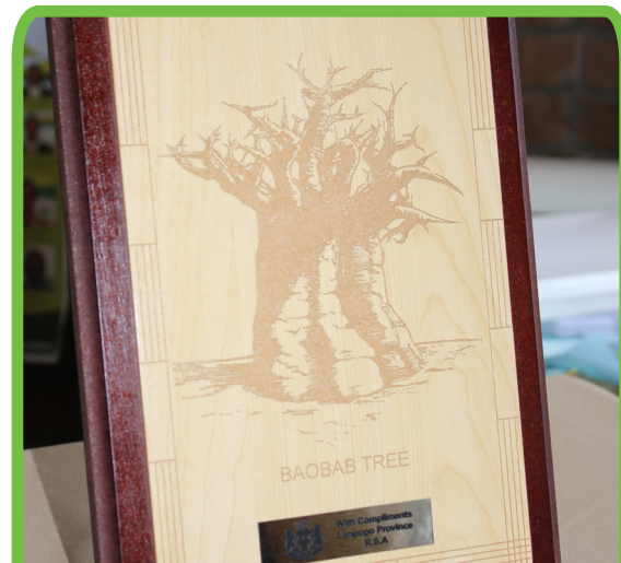
Baobab Tree Award for representing Limpopo with flying colours

With its goodies, this award should spur him on to achieve the best. He got a R20 000 Bursary to study management at the highest level, a R15 000 cash for personal use, a R12 000 cash to develop his schools, free weekend at a hotel in Johannesburg with his spouse. "This should have been a bit more so that I can share with my beloved colleagues." He concluded.