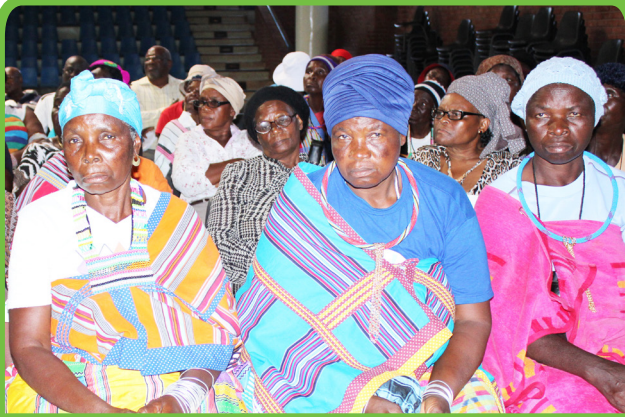
Senior Citizens busy focused during the workshop

The Thulamela Local Municipality has once again proved that age can't declare one an outcast. This time with The Senior Citizens' Workshop held at the Thohoyandou Town Hall on 23 February 2012.