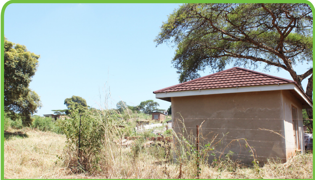
Above: a stand which is allegedly owned by four different individuals at loggerheads

Malindi said some areas reserved for the development of road networks were sold to stands rich people and resolving such problems cost the municipality a fortune. “This unacceptable conduct is costing our municipality lots and lots of money. The money which was supposed to help fast track the delivery of services to the people is now focusing on solving problems that are not supposed to exist in the first