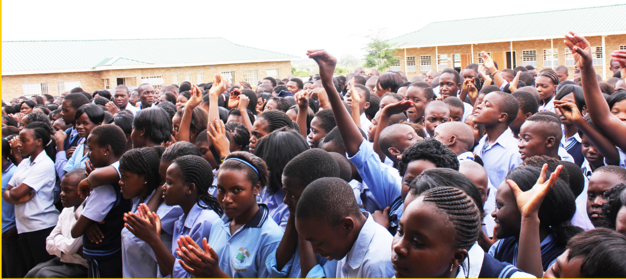
Learners participate in the motivation