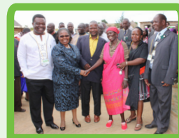
Thulamela Mayor's pledge to a destitute family...Page 3