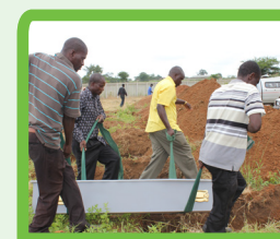
A proper and dignified send off to paupers...Page 9