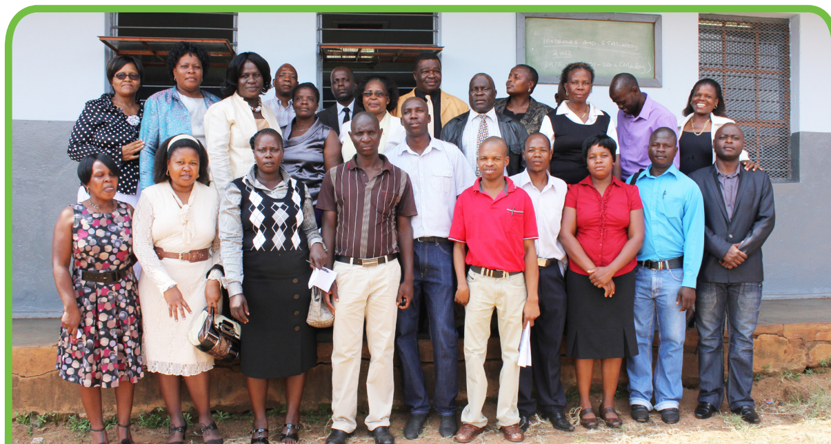
Thulamela councillors and teachers after a visit to one of the schools