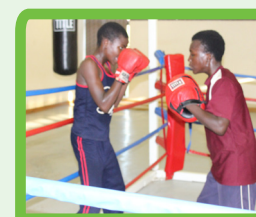
Malamulele Boxing Gymnasium hatches champions...Page 12