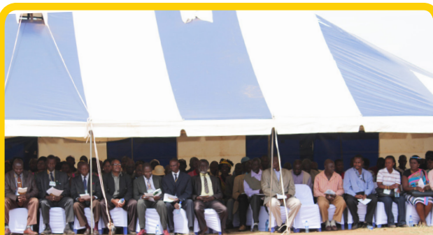
Community members listening to the Mayor's address